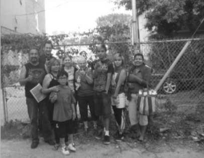
“neighbours keeping neighbours safe”

Thursday August 21 st Area 8 430 Langside (M.E.R.C) at 4:00pm