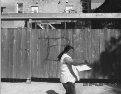
“finding graffiti and arson risks”